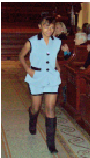
Alona deconstructed a woman's suit & trimmed it with sequins from an evening gown ...